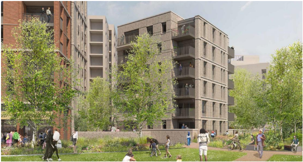
View of new Community Park and Moselle Walk