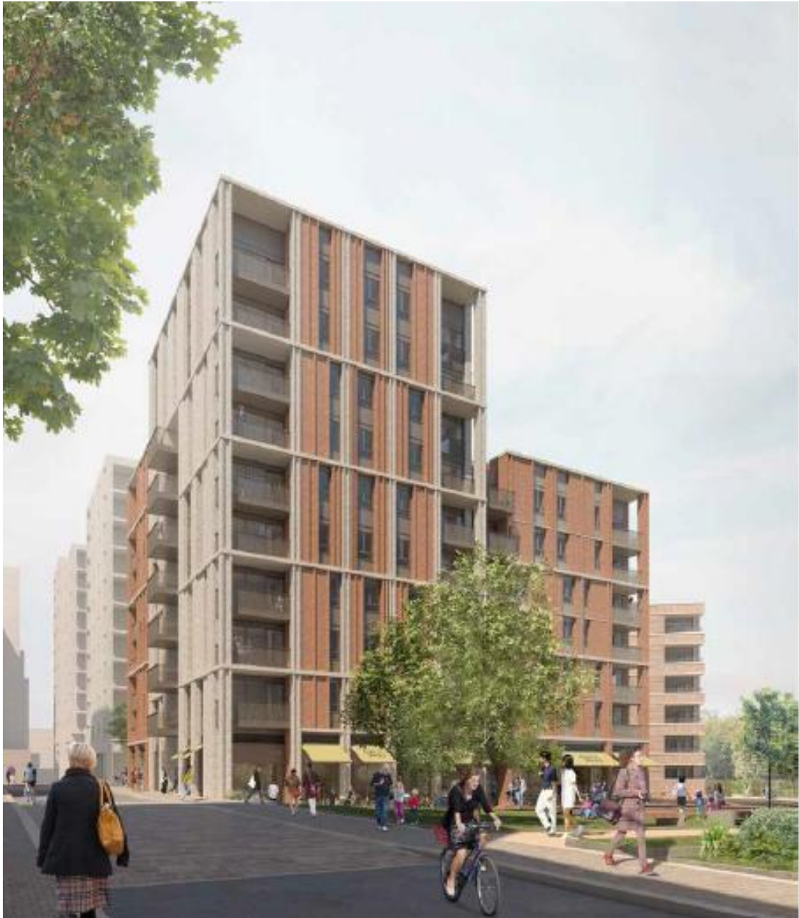
View north along Mary Neuner Road