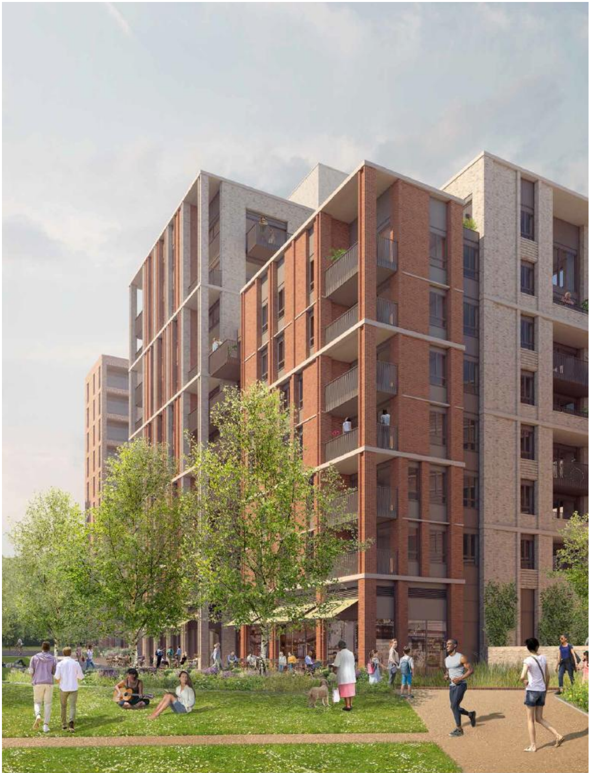
View from new Community Park looking across towards ground floor café.