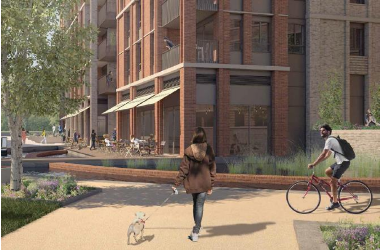
View looking across gasometer water feature to ground floor café use.