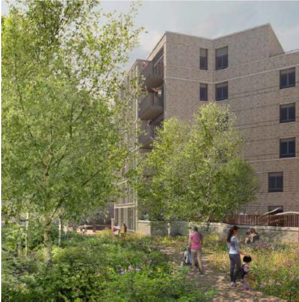
View looking south along the Moselle Walk