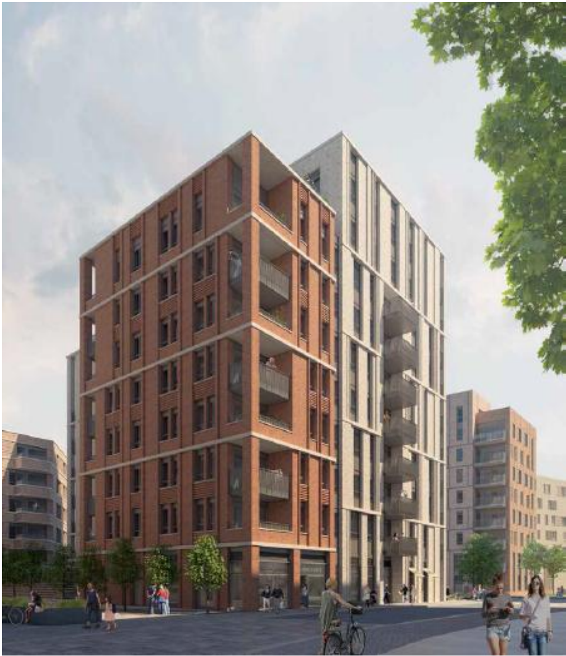
View looking south along Mary Neuner Road