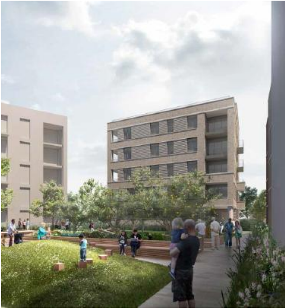
View looking from the central courtyard of the Eastern Quarter. Design of central courtyard indicative only and will be determined as part of a future reserved matters application (Development Zone E)