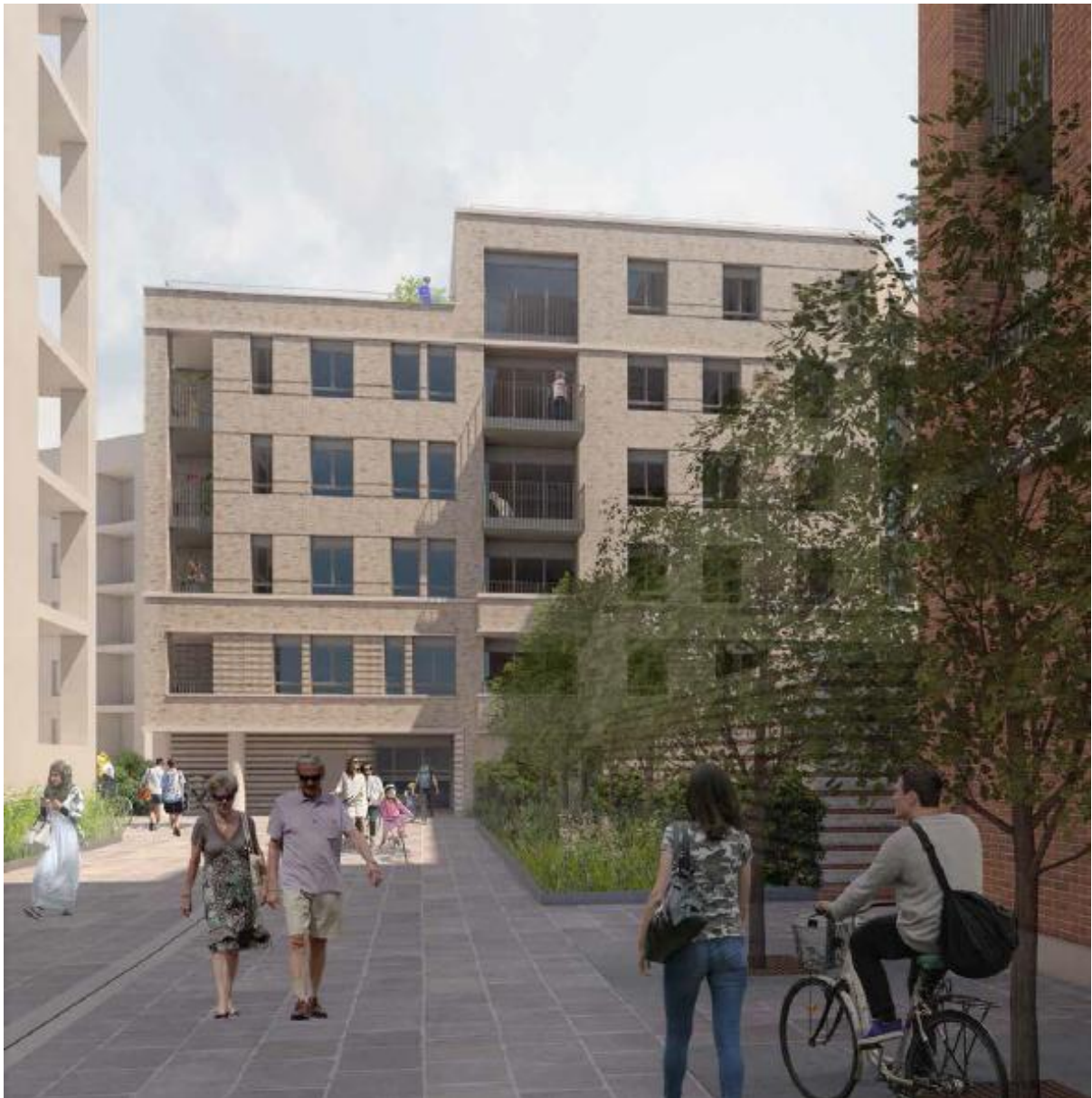
View looking east down communal courtyard towards main entrance